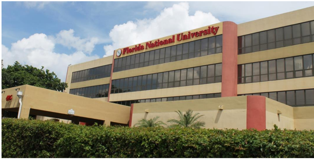
FNU's Main Campus